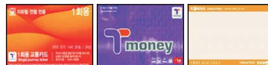
Single journey ticket